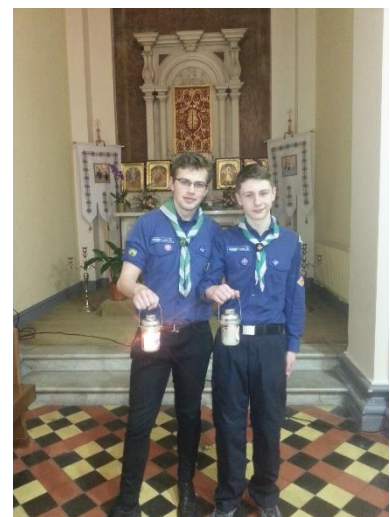
Updates from Sections